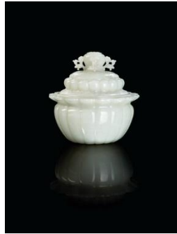
White jade longevity bowl Lian China, Qing Dynasty, Qianlong period (1736-1795) Estimate : €300,000-500,000