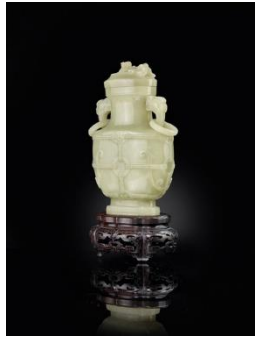
Yellow jade vase China, Qing Dynasty, Qianlong period (1736-1795) Estimate : €60,000-80,000

many masterpieces, the collection on offer will potentially impress even the most demanding connoisseurs. In 1963 and 1964, a few pieces from the collection were offered at auction in London. This December in Paris, the entire collection will be offered for the very first time on the market.