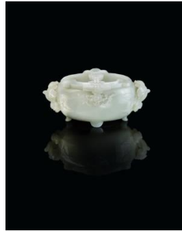
White jade marriage bowl China, Qing Dynasty, Qianlong period (1736-1795) Estimate : €300,000-500,000