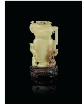
Yellow and brown jade archaic ewer China, Qing Dynasty, Qianlong period (1736-1795) Estimate : €80,000-120,000